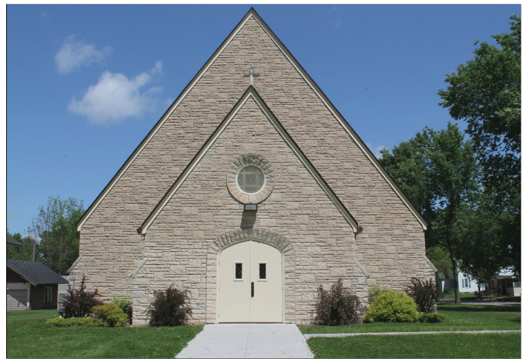
ST. MARY'S, GALESVILLE