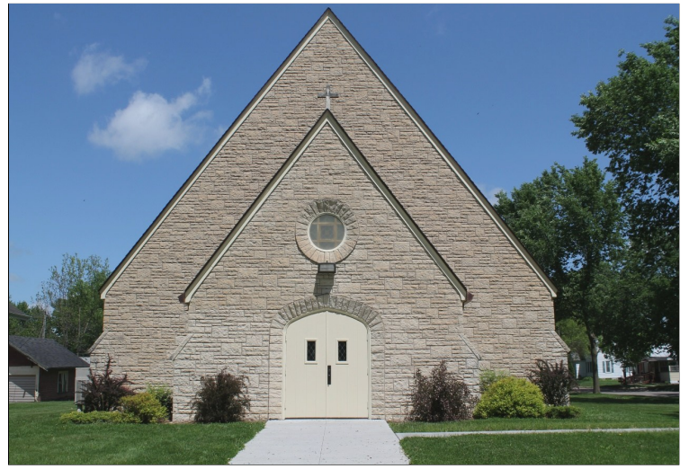
ST. MARY'S, GALESVILLE