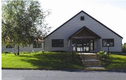
St. Ansgar Parish 607 E. Olson St, Blair WI

Roman Catholic Churches of Ettrick & Blair Sunday, May 31, 2026 The Solemnity of the Most Holy Trinity (A)