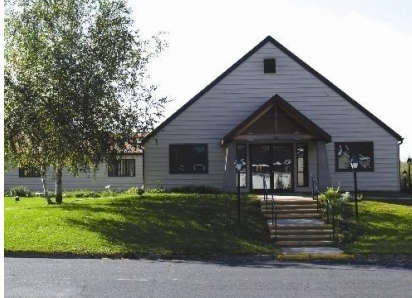
St. Ansgar Parish 607 E. Olson St, Blair WI