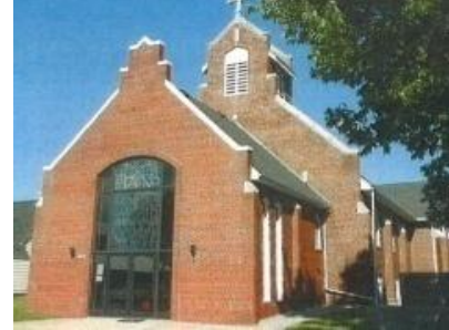
St. Bridget Parish 22650 Washington St, Ettrick WI