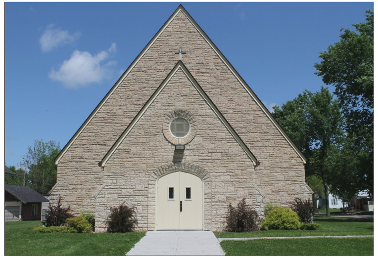
ST. MARY'S, GALESVILLE