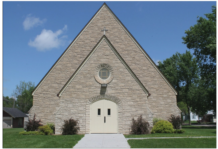
ST. MARY'S, GALESVILLE