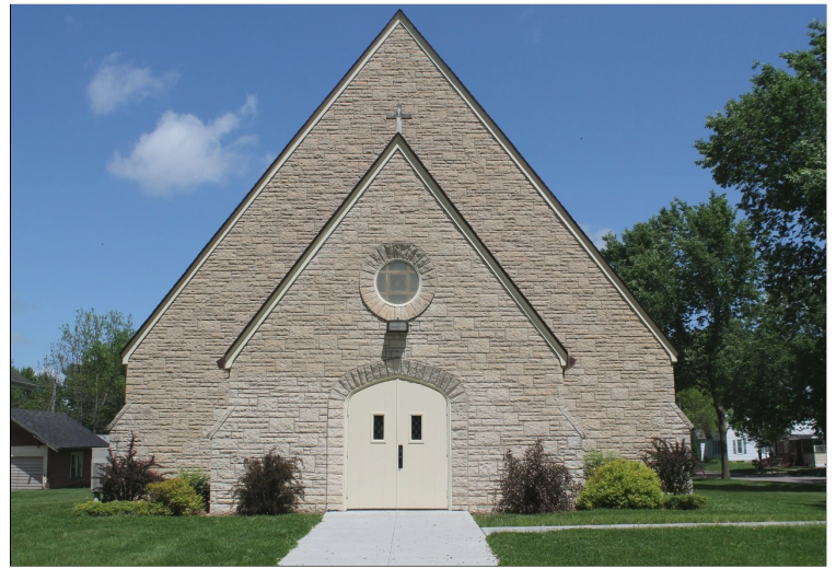
ST. MARY'S, GALESVILLE