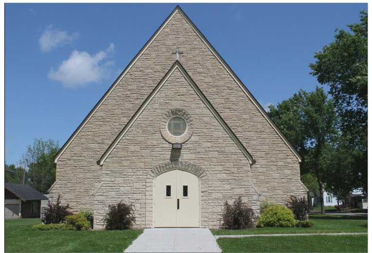
ST. MARY'S, GALESVILLE