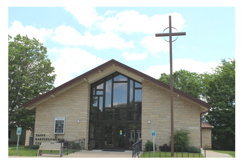
ST. BARTHOLOMEW, TREMPEALEAU