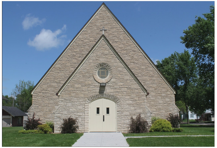
ST. MARY'S, GALESVILLE