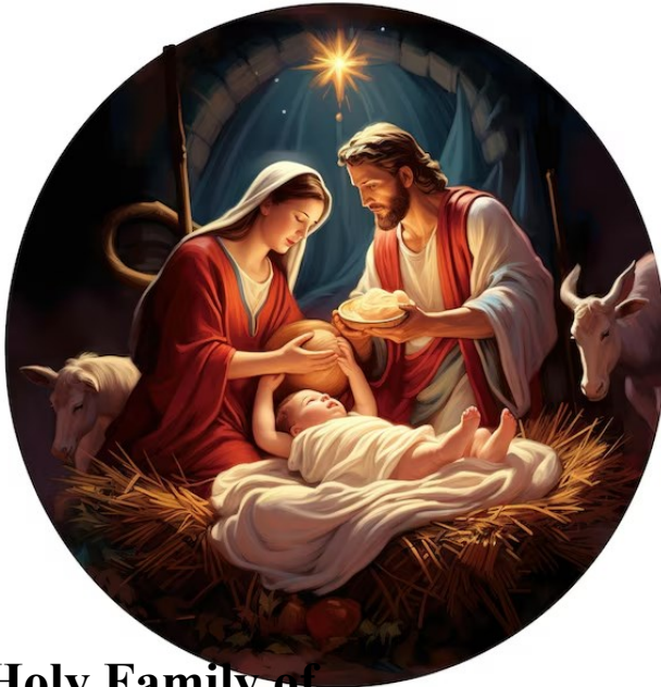
Holy Family of Jesus, Mary and Josphe