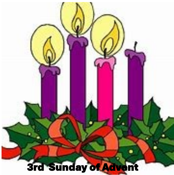
3rd Sunday of Advent