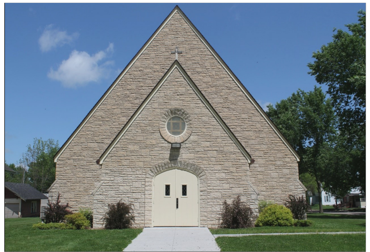
ST. MARY'S, GALESVILLE