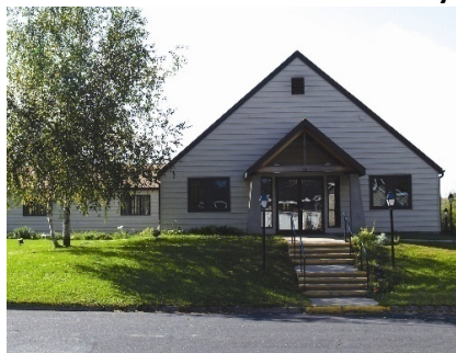
St. Ansgar Parish 607 E. Olson St, Blair WI

Twenty-Ninth Sunday in Ordinary Time (Year B)