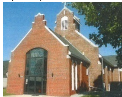
St. Bridget Parish 22650 Washington St, Ettrick WI