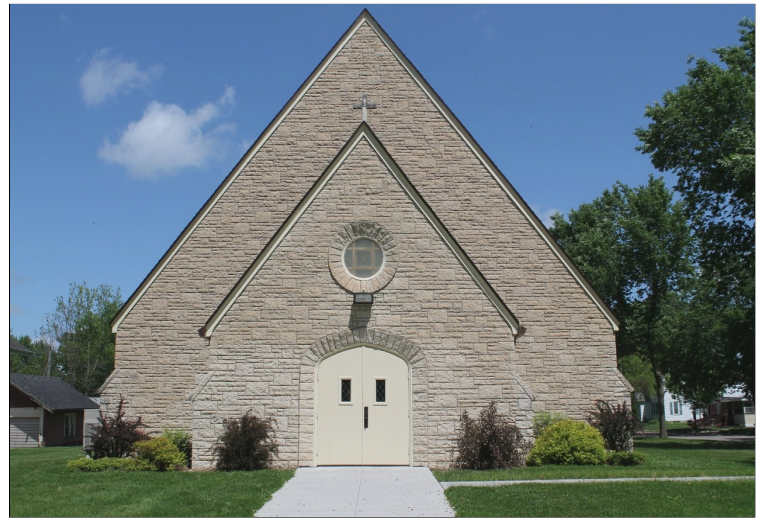
ST. MARY'S, GALESVILLE