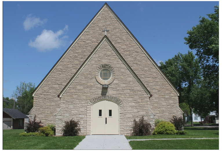
ST. MARY'S, GALESVILLE

I, the Lord, bring low the high tree, lift high the lowly tree, wither up the green tree, and make the withered tree bloom. As I, the Lord, have spoken, so will I do.