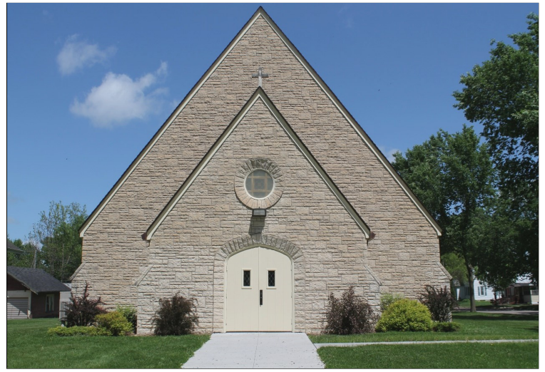
ST. MARY'S, GALESVILLE