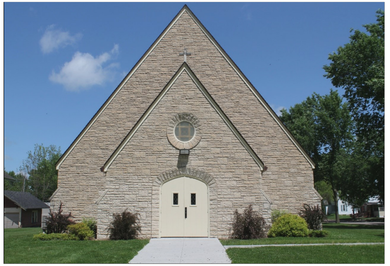
ST. MARY'S, GALESVILLE