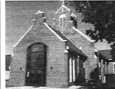
St. Bridget 22650 Washington St., Ettrick