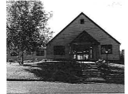
St. ANSGAR 607 East Olson St., Blair