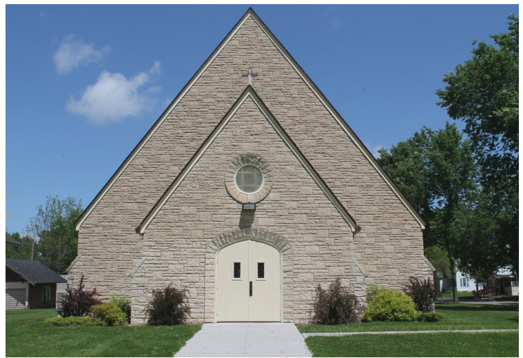
ST. MARY'S, GALESVILLE