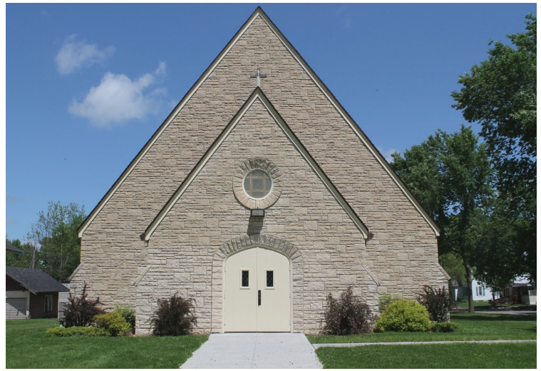
ST. MARY'S, GALESVILLE