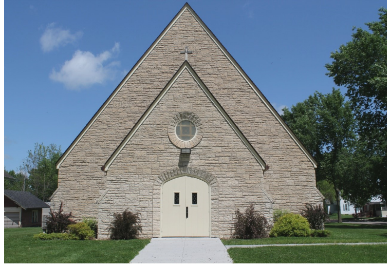
ST. MARY'S, GALESVILLE