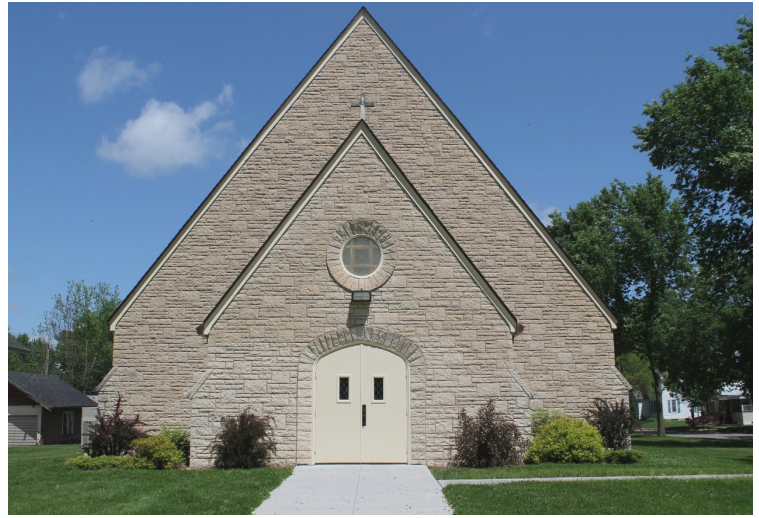
ST. MARY'S, GALESVILLE