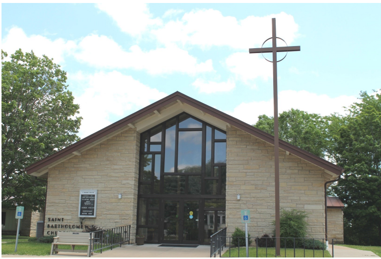
ST. BARTHOLOMEW, TREMPÉALEAU