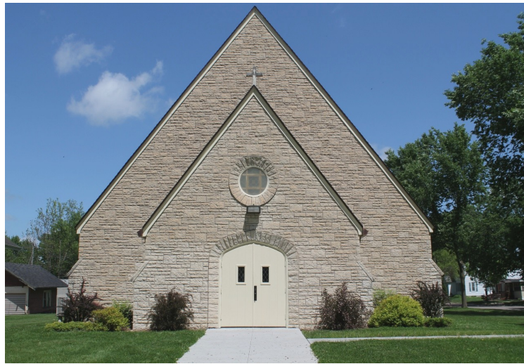
ST. MARY'S, GALESVILLE