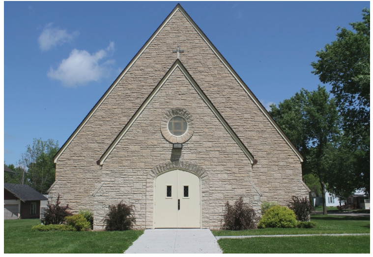
ST. MARY'S, GALESVILLE