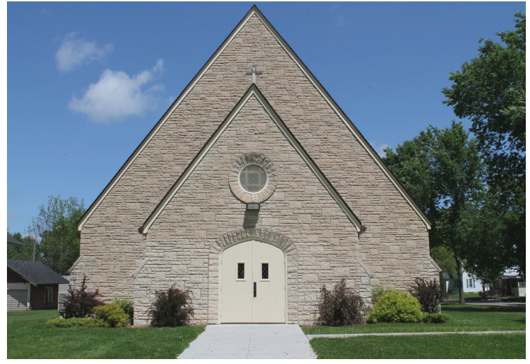
ST. MARY'S, GALESVILLE