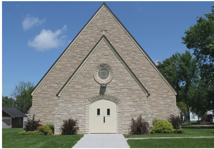
ST. MARY'S, GALESVILLE